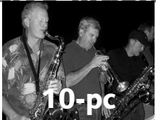
10-pc R&B Band